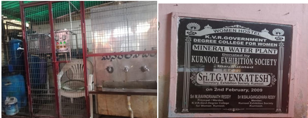
MINERAL WATER PLANT IN K.V.R.HOSTEL