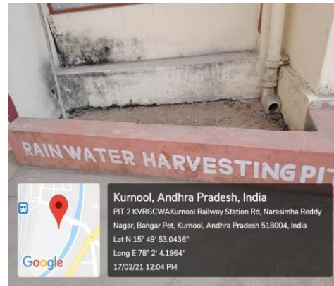
Near Department of English