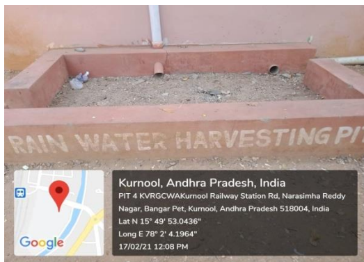
Back side of Room No-19